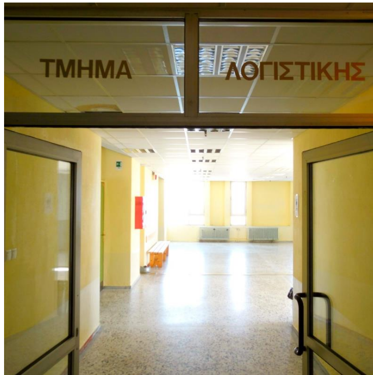
Figure 1. View of the Department's building

The Department is among the largest Departments of Accounting and Finance, well organized and dynamic. Approximately 3,500 students are enrolled and studying in it, while the number of students actively participating in the educational process amounts to 2,100.