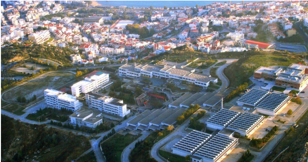
Figure 1: The University Campus of Kavala

The campus occupies an area of 132,000 m 2 with a coverage of 36,000 m 2 , of which 11,000 m 2 are classrooms, 11,000 m 2 are laboratories, 11,000 m 2 are 3 student residences with a capacity of 450 beds, and 3,000 m 2 the Library building. In addition to the basic infrastructure of its departments, the campus includes canteens, a restaurant, sports facilities, video conference rooms, and special rooms for meetings and events.