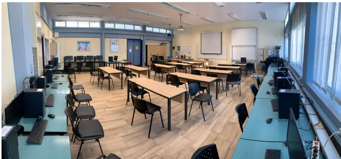
Figure 2. View of classroom